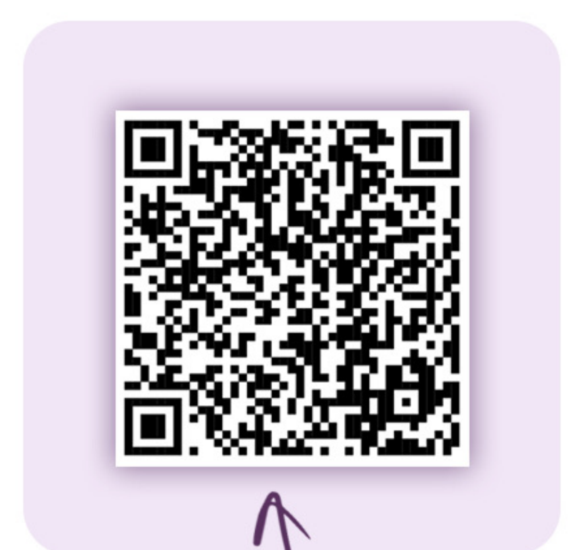
Use and care